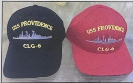
Marine red and Navy blue – $30.00 Delivered