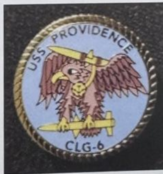
PROVIDENCE pins - 1 inch – $6.50 Delivered