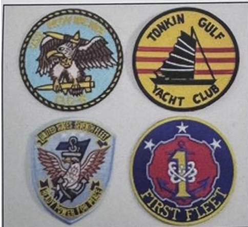
Patches 5" – $12.00 each, Delivered