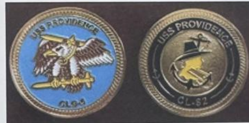
Double sided coin – $12.50 Delivered